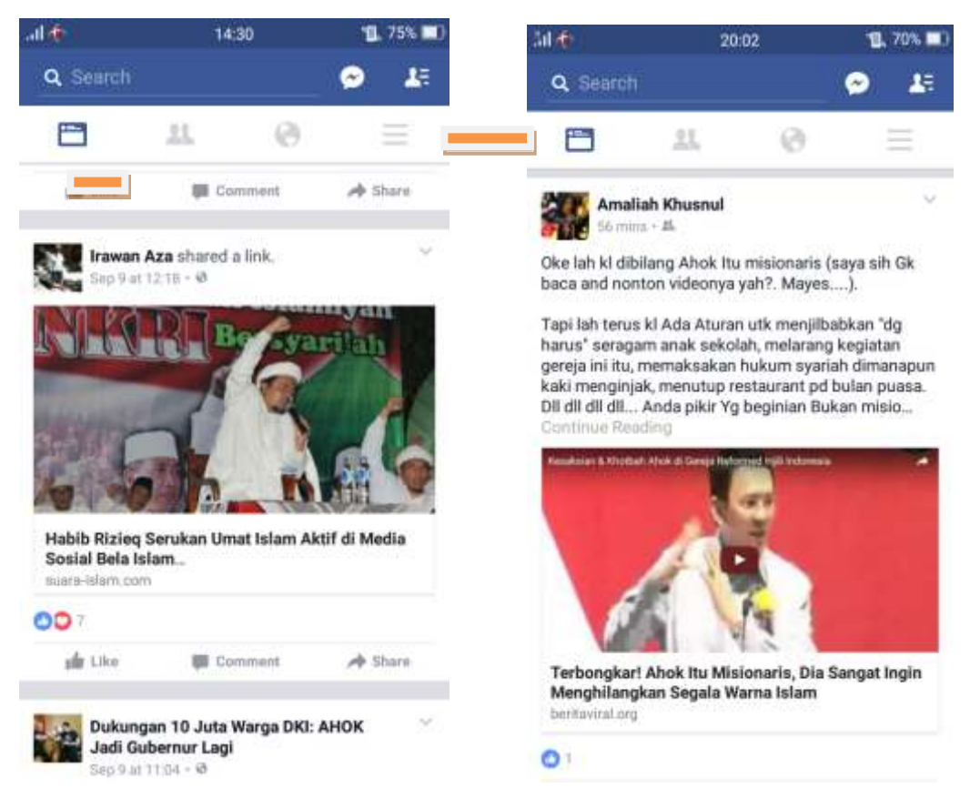
Figure 6. Provocation from FPI