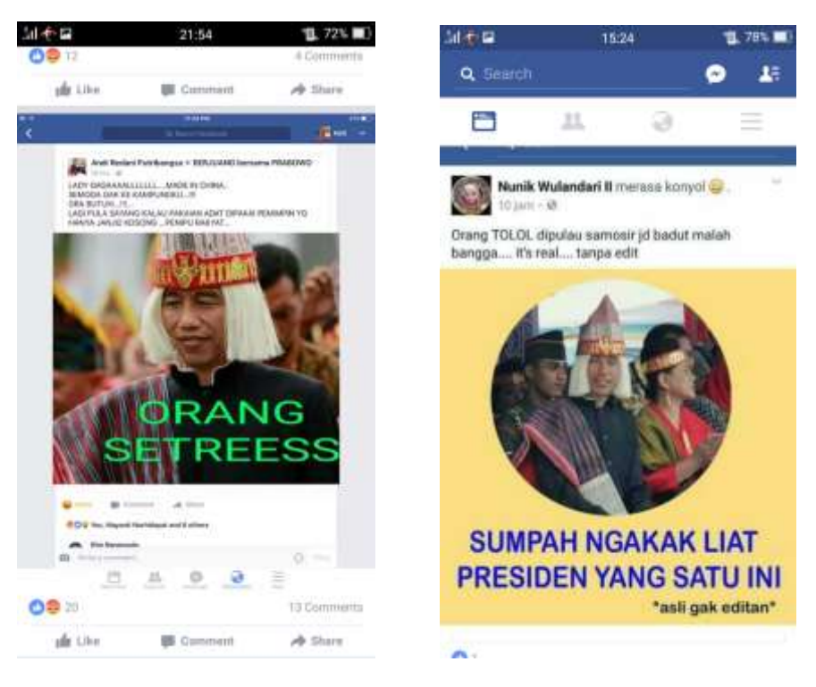
Figure 4 & 5. President Joko Widodo is being insulted in social media

Eventhough the Presidential election has passed but not all people can accept Joko Widodo as Indonesia's President. The pictures above showed how hatred was expressed by individual and shared to othersor a group few months ago. People made fun of president Joko Widodo and called him crazy when he was honoured with traditional costume in Samosir island, North Sumatra. It was shared by Prabowo's supporter. As mention before that social media can be a new democratic space but expressing idea or thought should not insult others especially president as a symbol of a country. This form of fanaticism can ignite conflict among users and it can be seen from the comments of each posting and some new postings that tried to defend Joko Widodo or gave a crarification about the traditional outfit and why it