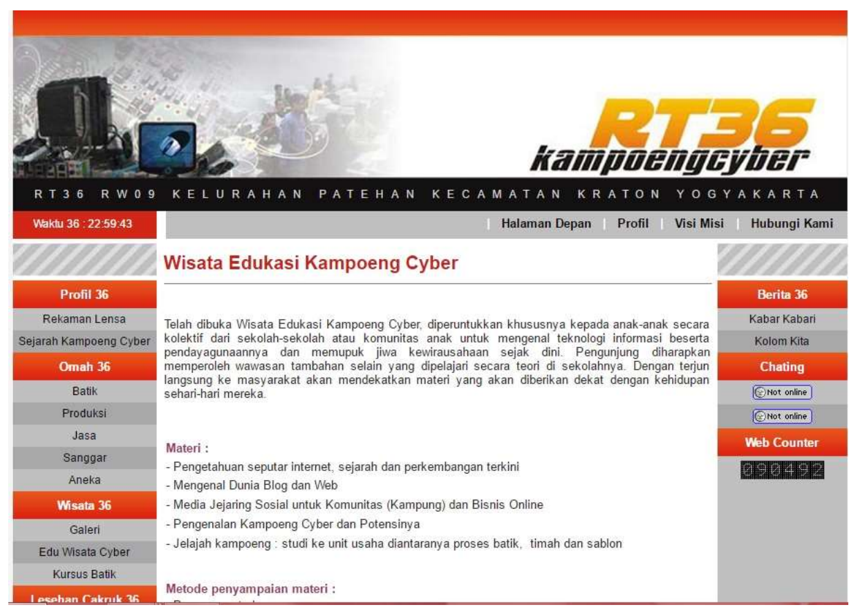
Figure 5. Education Tourism in Kampung Cyber