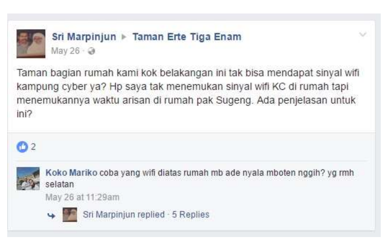
Figure 2. Communication on Facebook

Figure 2 indicates how communication system has changed in Kampong Cyber. Face-to-face communication system has been left behind, and it can be carried out fast and easy only on the social media of Facebook. The uses of new media in Kampong Cyber is not only again as the tool of marketing but it also becomes inter-resident communication facility. Notice and news are