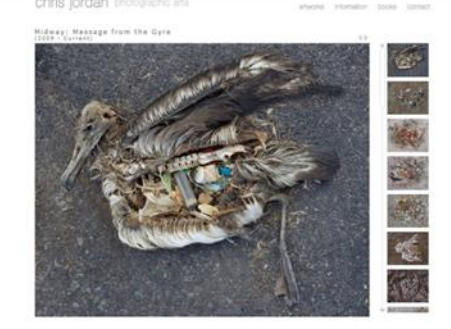
Figure 3. Online media review the topic about environmental issue (source: kompas.com)

Figure 4. Photography from Chris Jordan (source: chrisjordan.com)