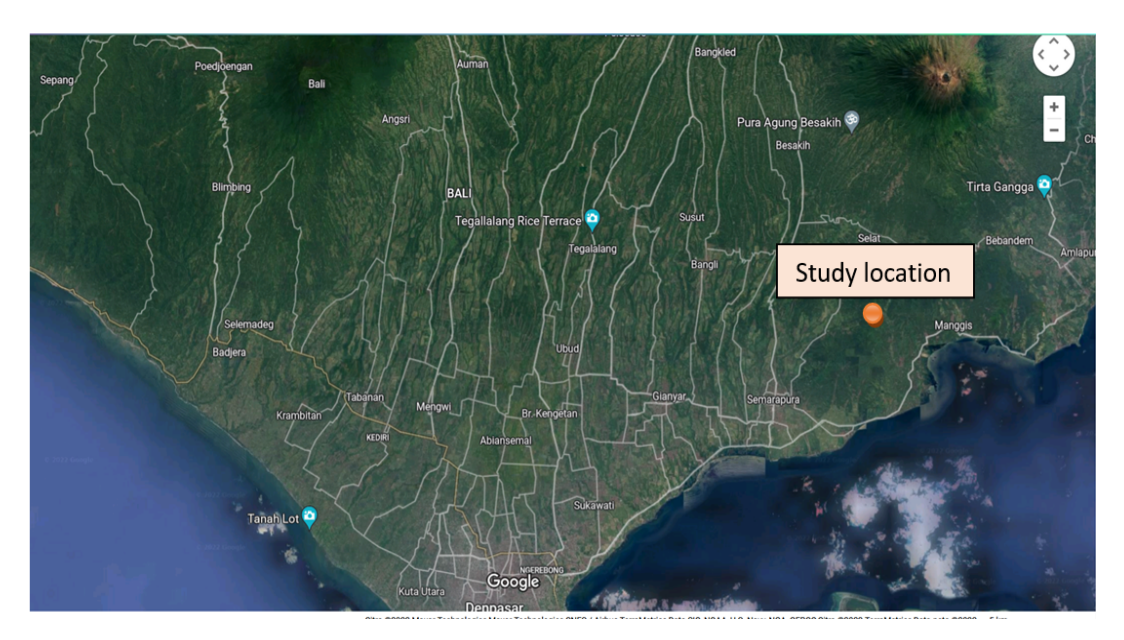
Figure 1. Study Location [13]

This research was conducted by using observation techniques. Observation is an activity to observe a process or object to understand of phenomena based on observations. Observations were made to determine the composition of waste and waste containers at the study site. The observations were then compared with the ideal conditions from the existing literature study. This research was conducted in one of the waterfall tourist areas in Klungkung Regency, Bali Province (Figure 1), in December 2020.