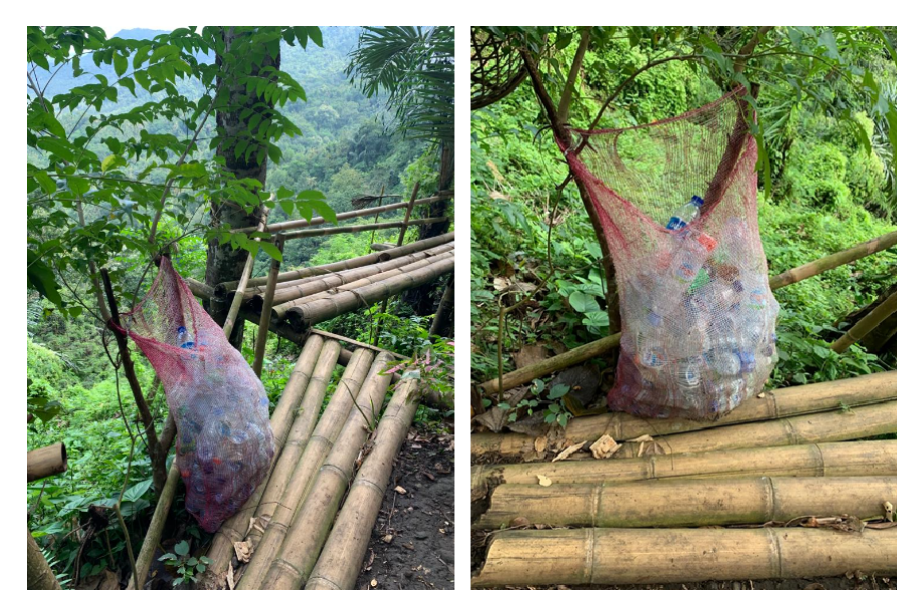
Figure 2. PET Waste Storage at the Study Location

There is already a particular grouping of PET trash bins (Figure 2). So that waste is not mixed when processed and is difficult to separate. This can cause waste that can be processed to be wasted. Therefore, besides providing trash cans with separate types of waste, there needs to be further handling of the waste itself, starting with providing education about the definition of waste. Based on the observation by grab sampling, PET waste generation is 1.24 kg/day, where PET dominates 43.5% (w/w) of the total waste in the study site.