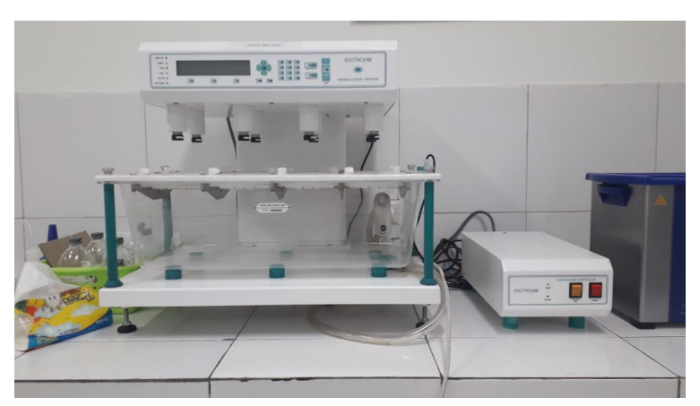
Figure 2. Electrolab dissolution tester equipment

The dissolution test of the tablets were conducted by using a dissolution tester as it can be seen in Figure 2 below. The dissolution medium used was 900 ml 0.1N hydrochloric acid. This solution was prepared by diluting 8.5 ml of concentrated hydrochloric acid with distilled water up to 1000 ml. This test used a type 1 stirrer (basket shape mixer) with a speed of 100 rpm for 45 minutes.<sup>7</sup>