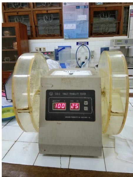
Figure 1. Friability tester

The tablet hardness test was conducted by using a hardness tester. This test observed scales achieved when the tablets was broken or appropriately destroyed. The scale indicator on the hardness tester before testing must be in the zero position. The hardness test of each tablet was organized by turning the tester slowly until the table t was broken or appropriately destroyed.<sup>6</sup>