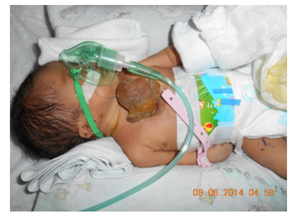
Figure 1. The clinical presentation. Four chambers of the heart lies completely outside thoracic cavity

Stable hemodynamics were documented when she came. She had shortness of breath, her respiratory rate was 56 times per minute. The heart lies outside the thoracic cavity with the apex pointing towards her neck. Right atrium, left atrium, right ventricle, and left ventricle were identified completely exposed with no skin or membrane or pericardium coverage as seen in Figure 1. Cleft lip and palate (CLP) were also identified. There was no abdominal wall defect found. There was no other defect reported.