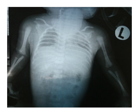
Figure 2. Chest x-ray showed the thoracic cavity is relatively small compared to the size of the ectopic heart

no abnormality of the lung detected as seen in Figure 2. Echocardiography showed complete atrioventricular canal, small secundum atrial septal defect, mild pulmonary stenosis, and atrioventricular regurgitation.