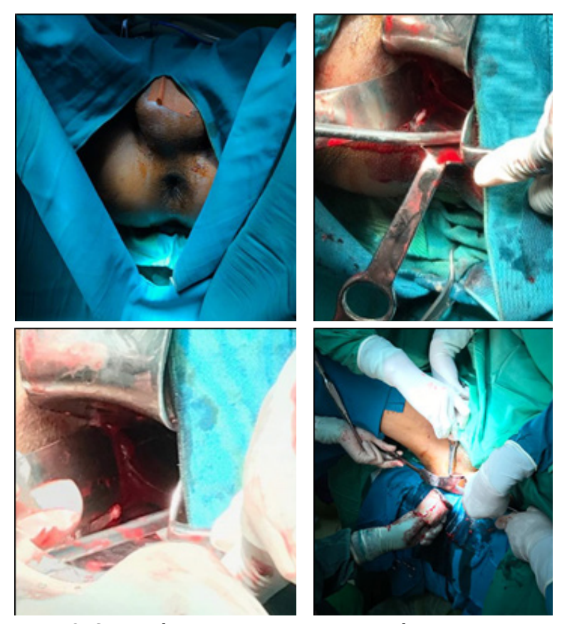
Figure 2. Corpus alienum evacuation process in the operating room. This image is the author's personal collection.

The patient has diagnosed with corpus alienum rectum, and foreign bodies evacuation