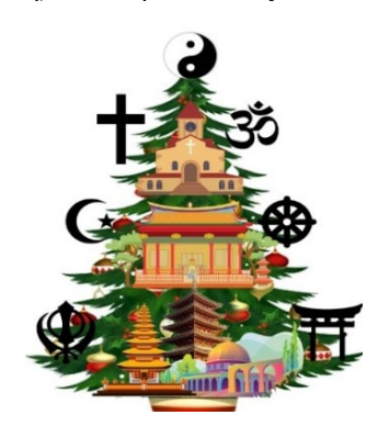
Figure 1 Syncretic practices of the New Age Movement

All followers of the new age movement tend to choose components that exist in modern major religions, such as components of worship, religious celebrations, prayer, fasting, and piety, which are combined with eastern (ancient) religions, such as shamanism, magic, druidism, gods (mother) earth, ancient Egypt like a cult. Therefore, Slick wrote that everyone's hopes are united with the chosen teachings of salvation, correct thinking, and knowledge. These are theologies of "good feelings", "universal tolerance", and "moral relativism" (Slick, 2008). Therefore, the new agers are united under the common bond of universal truth to form "a new world order". In this case, there is no longer one absolute truth—all are acceptable. Therefore, the finality of Christ was rejected by the new agers.