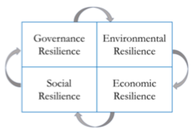
Figure 1. Graphic of Resilience Dimensions

The resilience of the tourism industry is needed to navigate through such pandemics. In this case, resilience can be seen from the conditions of impact from normal conditions than during a pandemic. In the trade tourism industry, resilience can be seen from the economic aspect which consists of Purchase of goods, Store Activities (Frago, 2021), price of selling goods (Liang et al., 2021), income level (Masbiran, 2020), commodition offered (Hu et al., 2021), social aspect: the composition of buyers by tourists (Liang et al., 2021), store labor (Masbiran, 2020), labor security deposit (Dewi et al., 2021), additional livelihood, living conditions (Hu et al., 2021), Government aspect: assistance provide, tax costs borne (Hu et al., 2021), the environmental aspect of decreasing the use of electrical energy, the quality of environment around the soter (Zhang et al., 2021), reducing the amount of waste (UCLC, 2021).