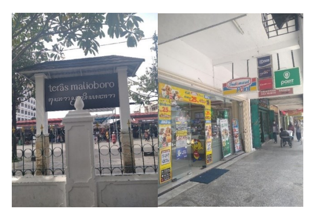
Figure 3. Tourism Industry Trade System

government and for Malioboro 2 is UPT (Task Implementation Unit) Malioboro. For the tourism system, the market trade industry in the Malioboro area is the Beringharjo Market. Many tourist needs are met by the trade tourism industry such as shopping, eating, souvenir facilities, and places to hang out. Since the existence of the trade tourism industry, the development of the region has increased so that it is more prosperous for the community. Figure 3 shows the tourism industry trade system in Malioboro.