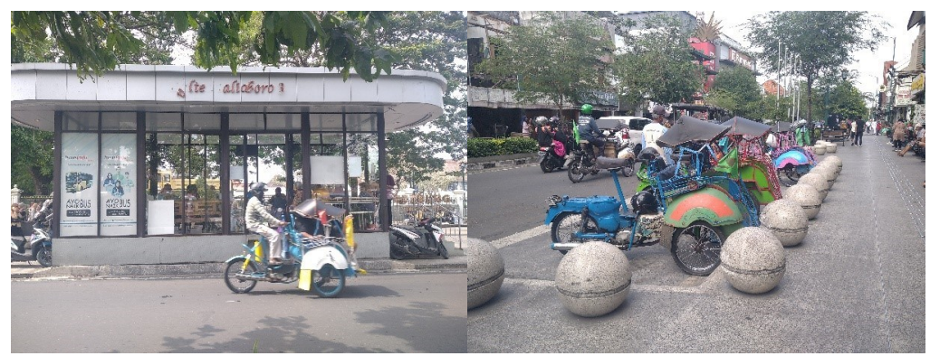
Figure 5. Transportation Tourism Industry

there is a non-motorized transportation tourism industry in the form of andong and becak which can be said to be a tourist transportation tool in Malioboro. The existence of becak and andong is one of the attractions for tourists visiting Malioboro tourist attraction. In its development, the number of pedicabs and andongs in Malioboro has a large number, where many pedicab or andong drivers hang out in Malioboro during vacation time. The purpose of the becak and andong is to help tourists if they are reluctant to go around Malioboro on foot and go to tourism support places such as souvenir shops and bakpir places. The becak and andong rates are priced at an average price of 10,000 rupiah. Another transportation industry in Malioboro is the Trans Yogja bus. This Trans Yogja bus passes through Malioboro and connects with other areas.