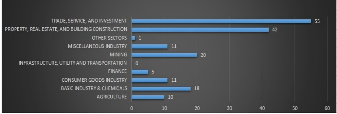
Figure 2. Sectors Delayed in Publishing Financial Reports on the Indonesia Stock Exchange (BEI) in 2022

In Figure 1, it is indicated that in the year 2019, there were 42 companies that were delayed in publishing financial reports. In the year 2020, there was a significant increase, with a total of 88 companies experiencing delays in publishing financial reports. The year 2021 also saw a notable rise, with 91 companies being delayed in publishing financial reports. However, in 2022, there was a decrease, with 61 companies being delayed in publishing financial reports. In the year 2021, companies in the trade, services, and investment sectors experienced the most delays, totaling 55 companies. Meanwhile, data on companies that are delayed based on sub-sectors in the Indonesia Stock Exchange can be seen in Figure 2.