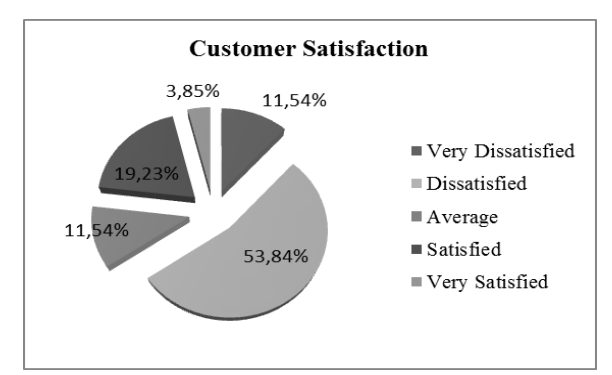
Figure 1. Percentage of Customer Satisfaction.

netral (each of them N=3). While the rest is in very satisfied category, which is 3,85% as shown in figure 1.