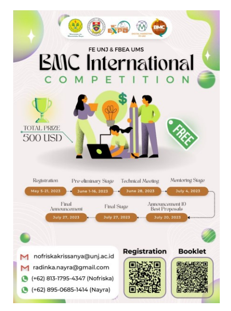
Figure 1. e-Flyer BMC International Competition

promoting activities is carried out by distributing activity e-flyers through social media and Universitas Negeri Jakarta (UNJ) partners at home and abroad. Promotion of activities is carried out during May 2023, with the registration process from May 8 - May 21, 2023.